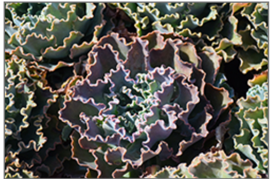
Green Mexican Hens

This is a dense herbaceous evergreen houseplant with tall flower stalks held atop a low mound of foliage. Its relatively fine texture sets it apart from other indoor plants with less refined foliage. This plant should not require much pruning, except when necessary to keep it looking its best.