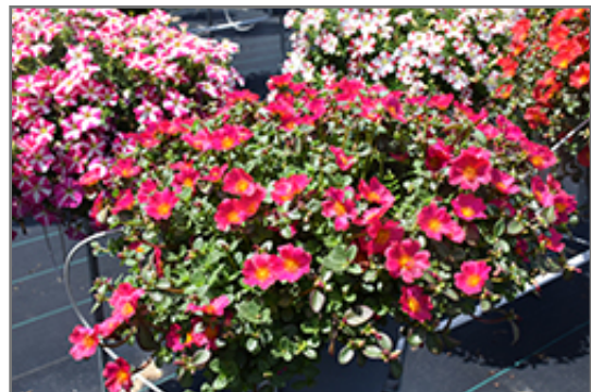
Pazzaz Nano Fuchsia Portulaca in bloom