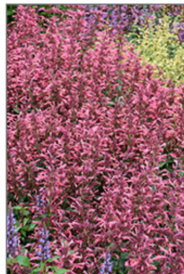
Summerlong Coral Hyssop flowers

Summerlong Coral Hyssop is recommended for the following landscape applications;