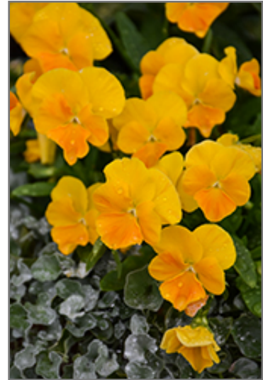
Halo Golden Yellow Pansy flowers