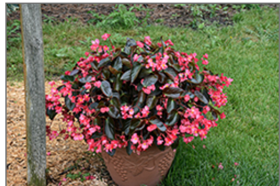
Dragon Wing Pink Bronze Leaf Begonia in bloom