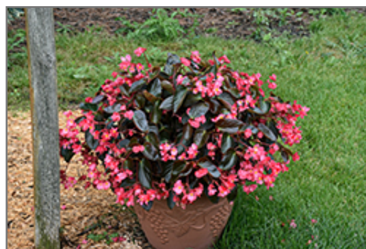
Dragon Wing Pink Bronze Leaf Begonia in bloom