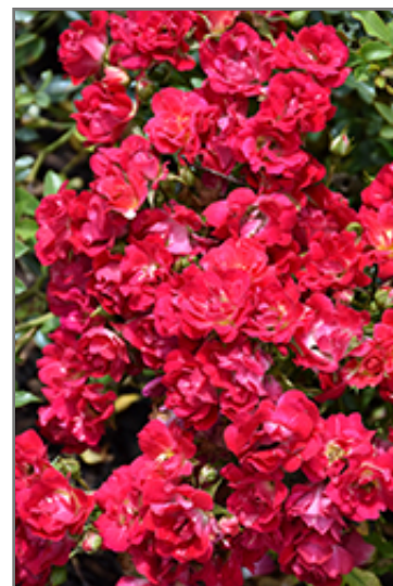
Red Drift Rose flowers

Red Drift Rose is recommended for the following landscape applications;