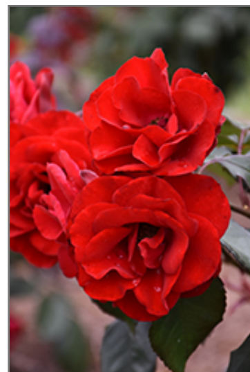
Europeana Rose flowers

The Europeana Rose is recommended for the following landscape applications;