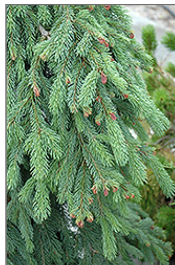
Weeping White Spruce foliage