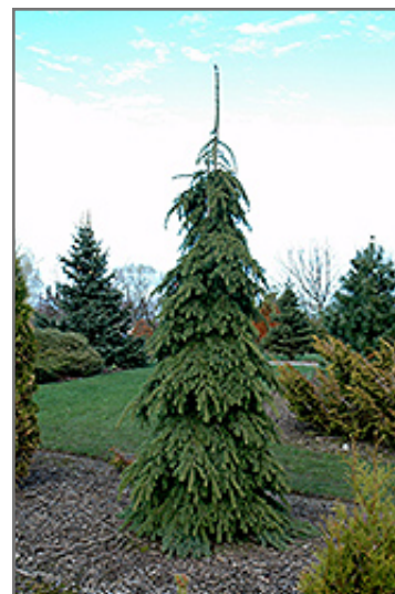
Weeping White Spruce