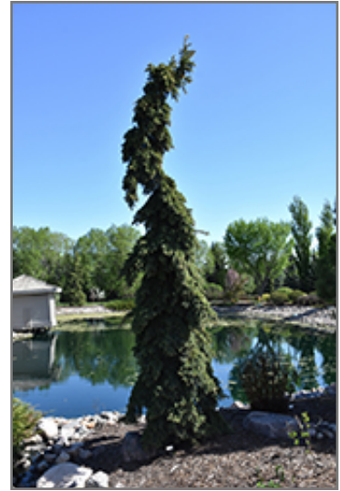
Weeping White Spruce

This tree does best in full sun to partial shade. It prefers to grow in average to moist conditions, and shouldn't be allowed to dry out. It is not particular as to soil type or pH. It is somewhat tolerant of urban pollution, and will benefit from being planted in a relatively sheltered location. This is a selection of a native North American species.