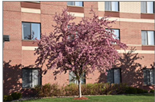
Robinson Flowering Crab in bloom

Robinson Flowering Crab is recommended for the following landscape applications;