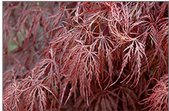
Crimson Queen Japanese Maple foliage

Crimson Queen Japanese Maple is recommended for the following landscape applications;