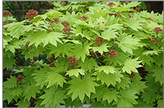
Golden Full Moon Maple foliage

Golden Full Moon Maple will grow to be about 20 feet tall at maturity, with a spread of 20 feet. It has a low canopy with a typical clearance of 2 feet from the ground, and is suitable for planting under power lines. It grows at a slow rate, and under ideal conditions can be expected to live for 60 years or more.