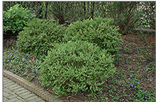
Wintergreen Boxwood