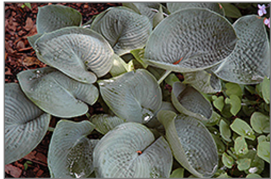
Abiqua Drinking Gourd Hosta foliage