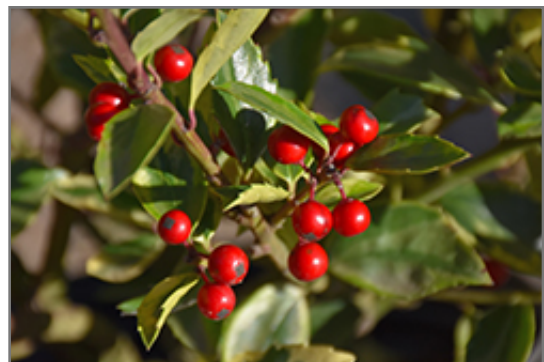
Honey Maid Meserve Holly fruit