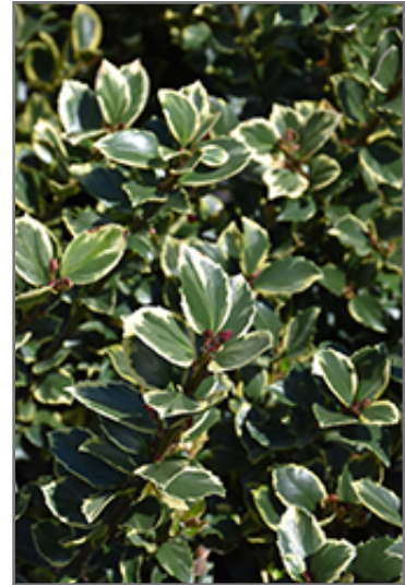
Honey Maid Meserve Holly foliage

Honey Maid Meserve Holly is recommended for the following landscape applications;