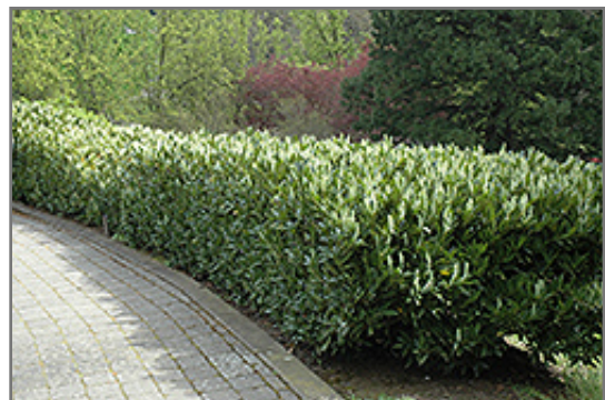
Schipka Cherry Laurel in bloom