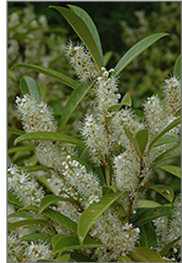
Schipka Cherry Laurel flowers

Schipka Cherry Laurel is recommended for the following landscape applications;