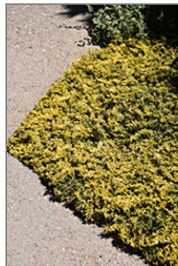
Mother Lode Juniper