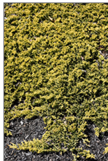
Mother Lode Juniper foliage