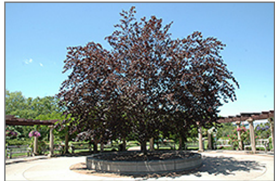
Purple Beech

Purple Beech is recommended for the following landscape applications;