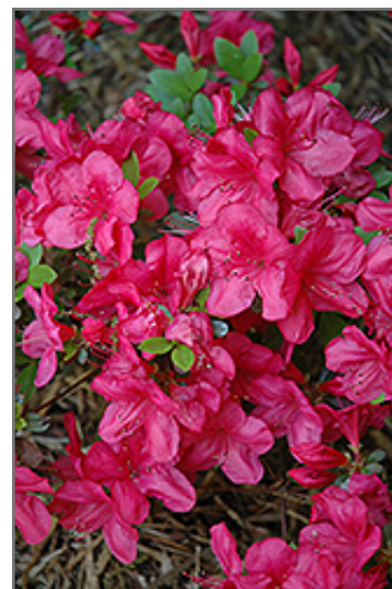
Mother's Day Azalea flowers

A riveting low growing variety with bright crimson blooms covering the branches in mid spring; showy when massed in a border or as a garden accent; absolutely must have well-drained, highly acidic and organic soil, use plenty of peat moss when planting