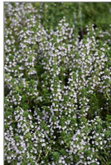
Doone Valley Thyme flowers

This plant will require occasional maintenance and upkeep, and is best cleaned up in early spring before it resumes active growth for the season. Deer don't particularly care for this plant and will usually leave it alone in favor of tastier treats. Gardeners should be aware of the following characteristic(s) that may warrant special consideration;