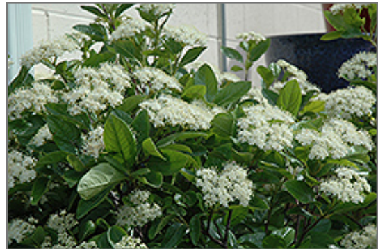
Winterthur Viburnum flowers

This is a relatively low maintenance shrub, and should only be pruned after flowering to avoid removing any of the current season's flowers. It is a good choice for attracting birds to your yard, but is not particularly attractive to deer who tend to leave it alone in favor of tastier treats. It has no significant negative characteristics.