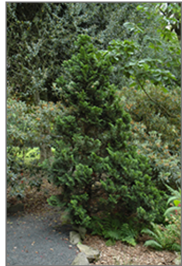
Nana Dwarf Hinoki Falsecypress

Nana Dwarf Hinoki Falsecypress is recommended for the following landscape applications;