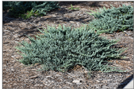
Blue Chip Juniper