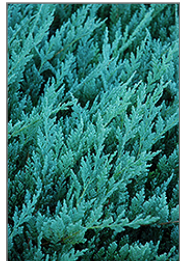
Blue Chip Juniper foliage