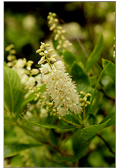
Summersweet flowers

Summersweet is recommended for the following landscape applications;