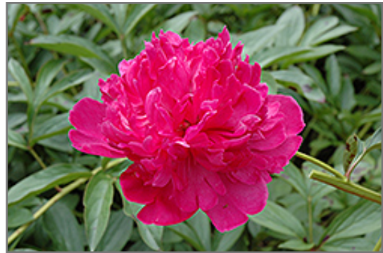
Felix Crousse Peony flowers