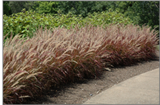
Purple Fountain Grass in bloom

Purple Fountain Grass will grow to be about 4 feet tall at maturity, with a spread of 3 feet. Although it's not a true annual, this plant can be expected to behave as an annual in our climate if left outdoors over the winter, usually needing replacement the following year. As such, gardeners should take into consideration that it will perform differently than it would in its native habitat.